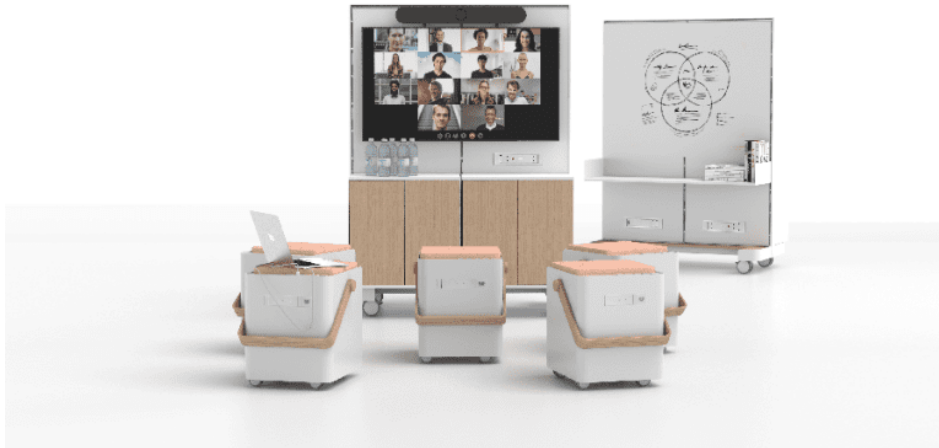
Gira Taboroids and tall walls

B+N Industries has successfully integrated our innovative QIKPAC battery into its high-quality Gira furniture line. This fusion brings energy and inspiration to offices, revolutionising workspaces. Gira inspires creativity, promotes true innovation, and creates a harmonious atmosphere. https://bnind.com/products/gira/